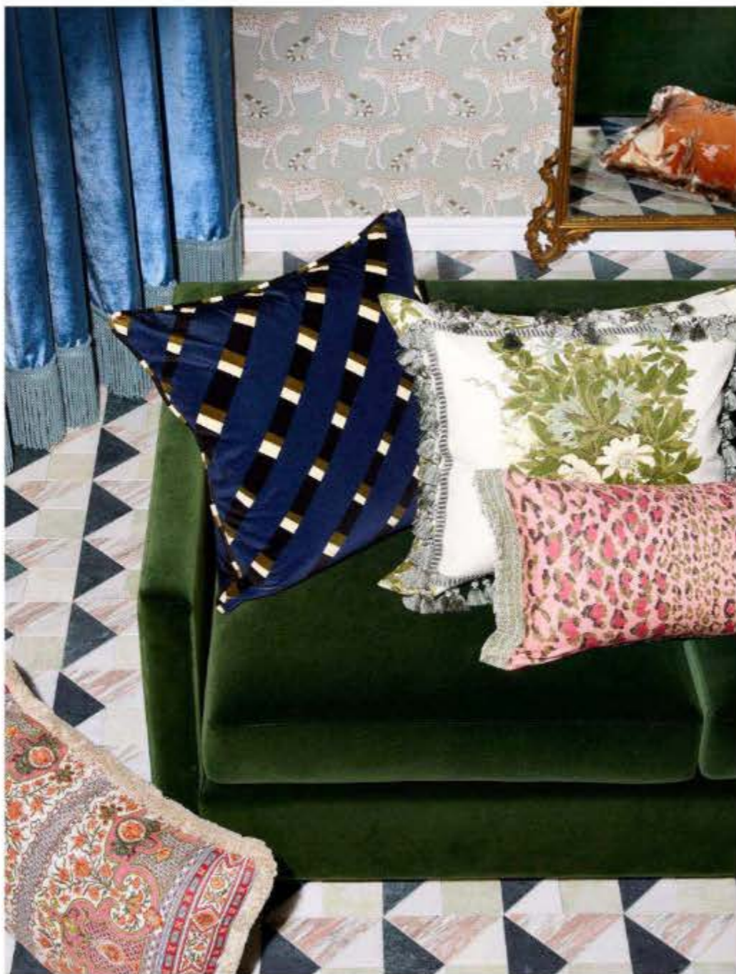
Cushions, from bottom left Brunschwig & Fils 'Digby 5 Teint' linen/cotton in Coral with Kravet 'Nushi' trim in Natural, both from Elliott Clarke. Pierre Frey India Mahdavi 'Stripes' cotton/polyester velvet in Night Dream from Milgate. Michael S Smith 'Jasper Malmison' linen/cotton in Fontaine with Kravet paired tassels in Mist, both from Elliott Clarke. Rose Cumming 'Sabu' cotton in Red/Rose with Sandboy linen tape in col. T35 12, both from Tigger Hall Design. House of Hackney 'Zeus' velvet cushion in Tobacco from Radford Furnishings.

Hit the refresh button on your inner world and plump up a glamorous square or two.